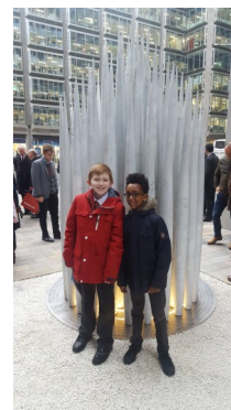
Lord Mayor War memorial reveal