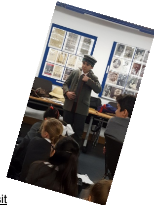
Michael Foreman visit