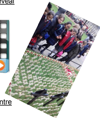
Field of Remembrance