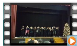
WW1 play at the Abbey centre